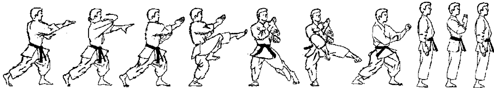
14. Knife hand palm up 15. Chamber 16. Knife hand palm down 17. Front kick 18. Low lead hook 19 & 20 Chamber & side kick 1. Offensive guard Gasho